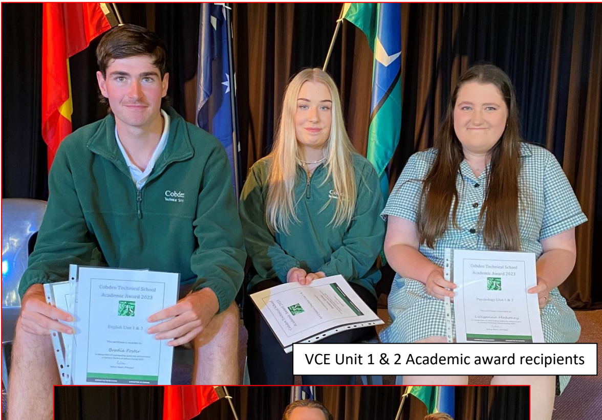
VCE Unit 1 & 2 Academic award recipients