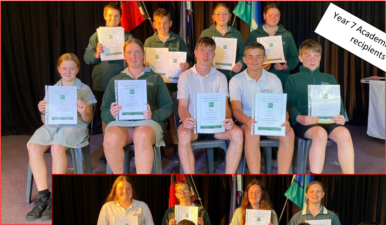
Year 7 Academic award recipients