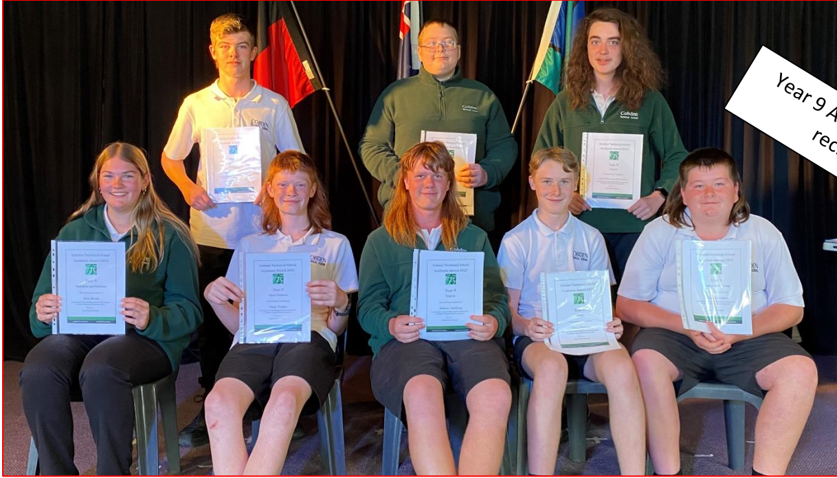
Year 9 Academic award recipients