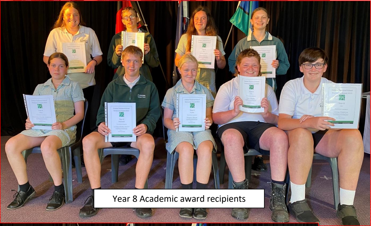
Year 8 Academic award recipients