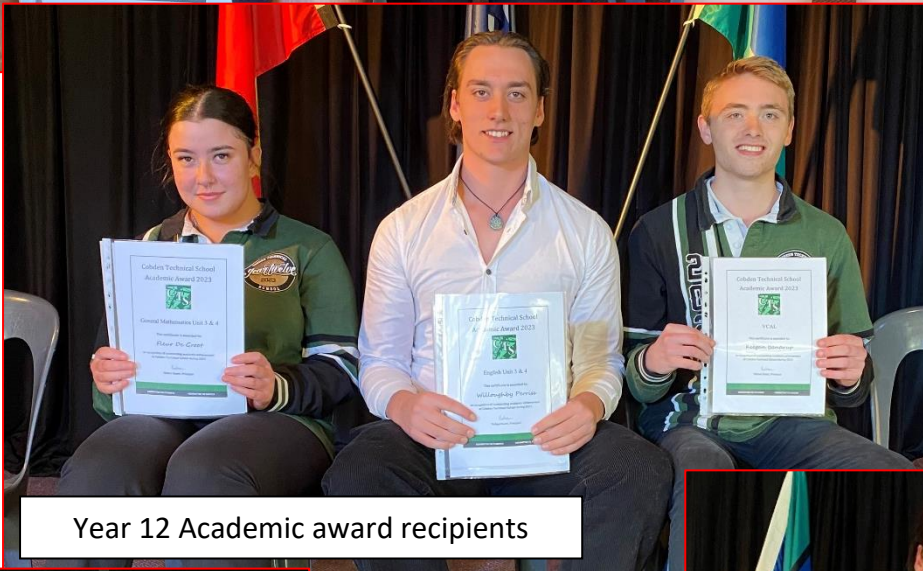
Year 12 Academic award recipients