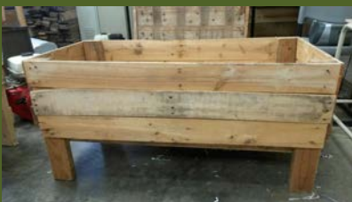
Planter Boxes Large $35 Small $25

If interested please contact the General Office on 55951202 for more details.