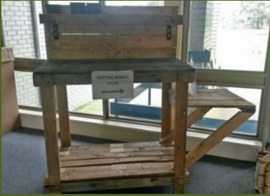
Garden or Work Bench $75

The following products are available for purchase, possibly as Christmas presents.