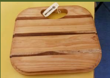
Chopping Board Stained $12 Raw $10